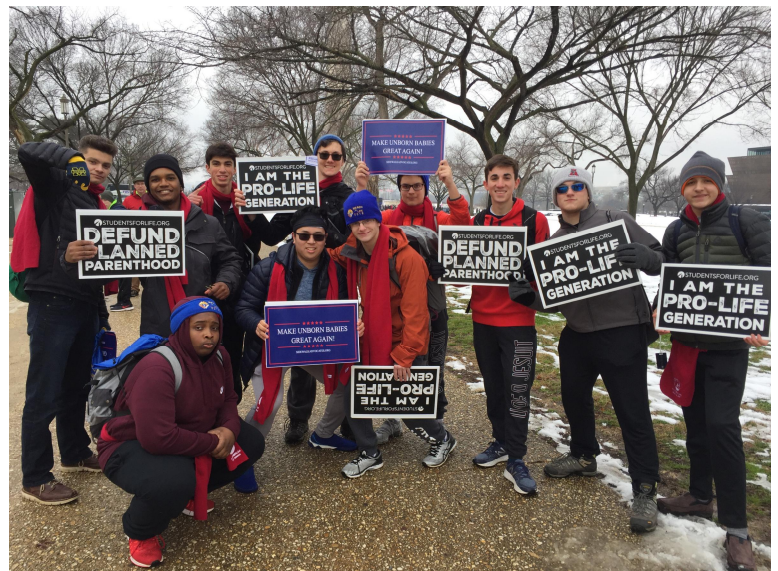
Pro Life March in Washington D.C. JAN2019

Now in Your love, protect against the wickedness of the devil, those little ones to whom You have given the gift of life. I ask that you help Another Way Pregnancy Center reach those considering abortion, and by Your Grace, changing their hearts and protect the unborn. Amen