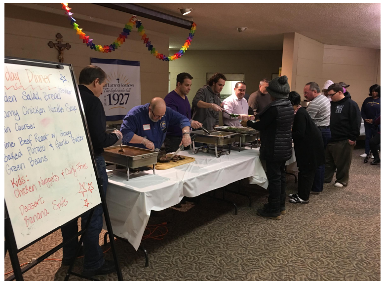
Shelter Week Dinner provided by KofC FEB 2019

Now in Your love, protect against the wickedness of the devil, those little ones to whom You have given the gift of life. I ask that you help Another Way Pregnancy Center reach those considering abortion, and by Your Grace, changing their hearts and protect the unborn. Amen