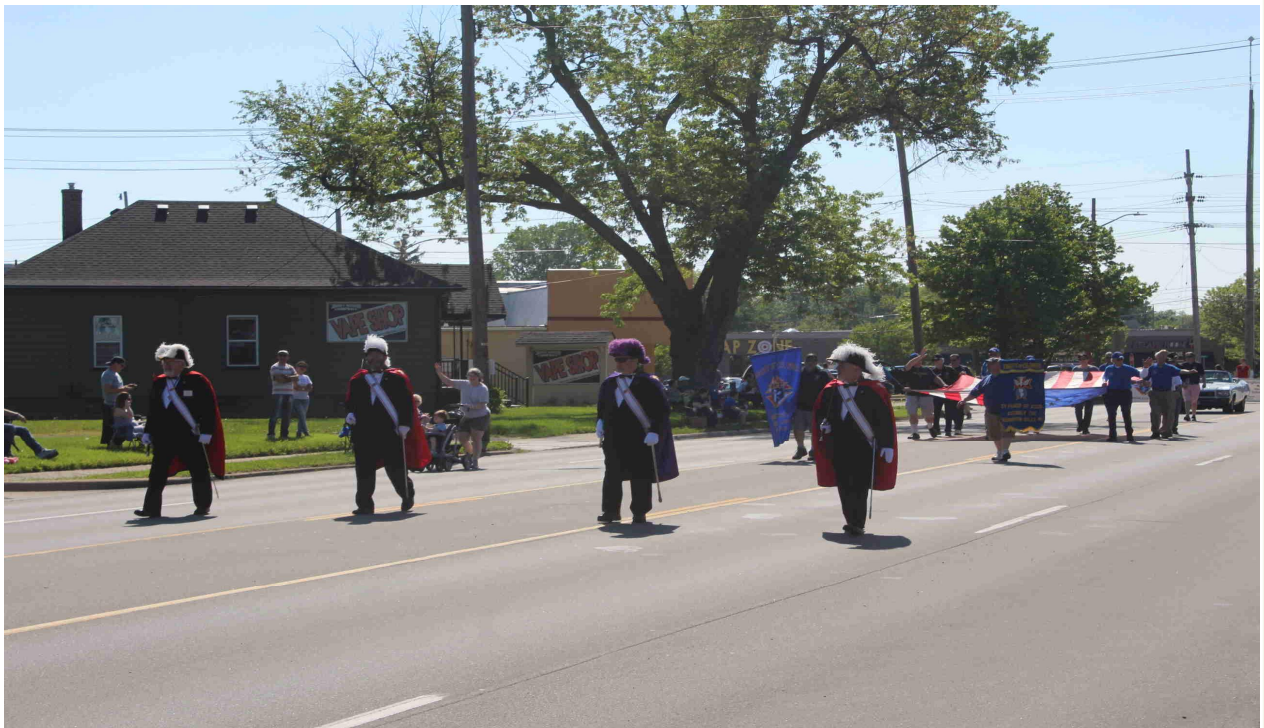
Farmington Memorial Day Parade 2019 , Color Corp escorts the Knights up Grand River Ave.

(ALSO PLEASE NOTE THERE IS NO COUNCIL BUSINESS MEETING IN JULY )