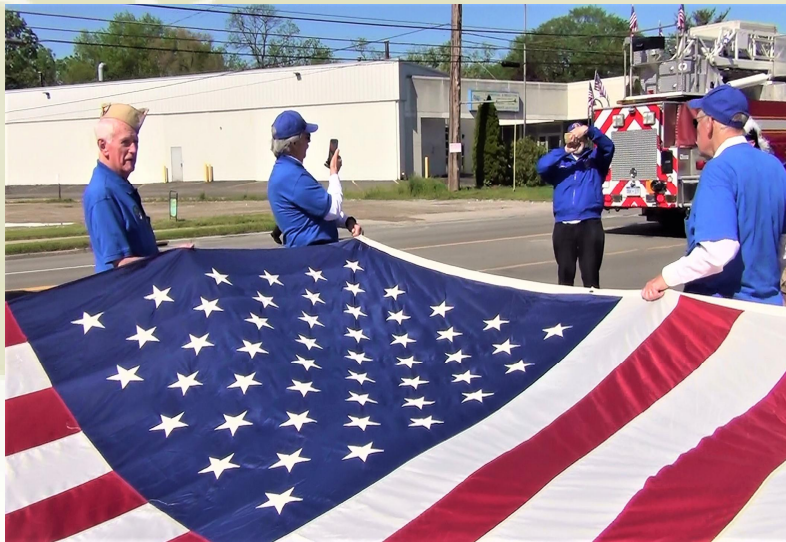
Knights participate in the annual Farmington Memorial Day Parade presenting the large United States Flag honoring American Veterans.