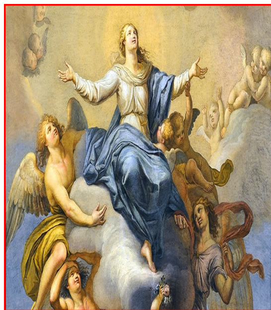
Detail | Ceiling of the Assumption of Mary in Santa Maria Immacolata a via Veneto, Rome

Corn Roast Picnic August 4 Rotary Park, Livonia