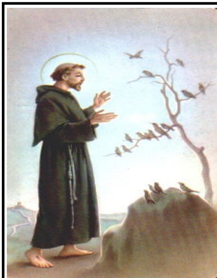
Feast of St. Francis of Assisi