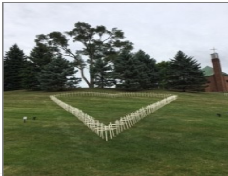
2019 Cross Initiative