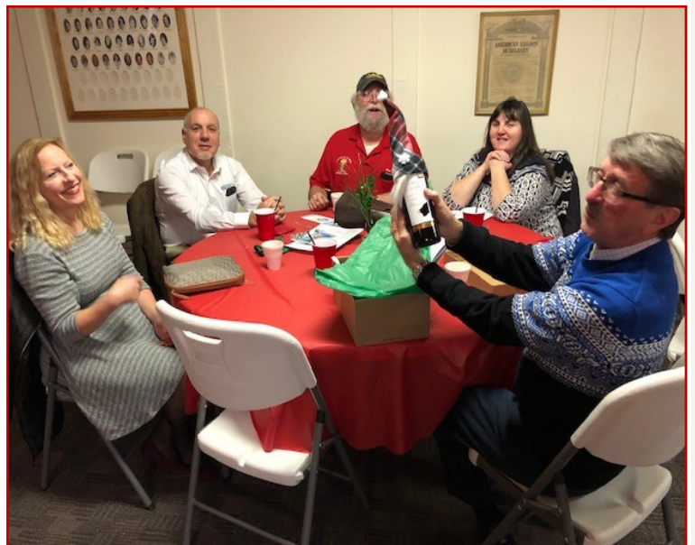
Brothers & Others enjoy the 2020 KofC Epiphany Gathering, held at the American Legion, Farmington