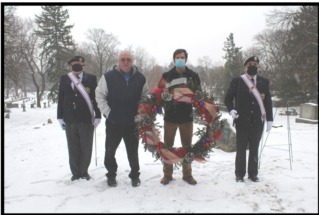
EVER THE PATRIOT, UNMASKED. WREATH TRIBUTE TO VETERANS OAKWOOD CEMETARY, FARMINGTON