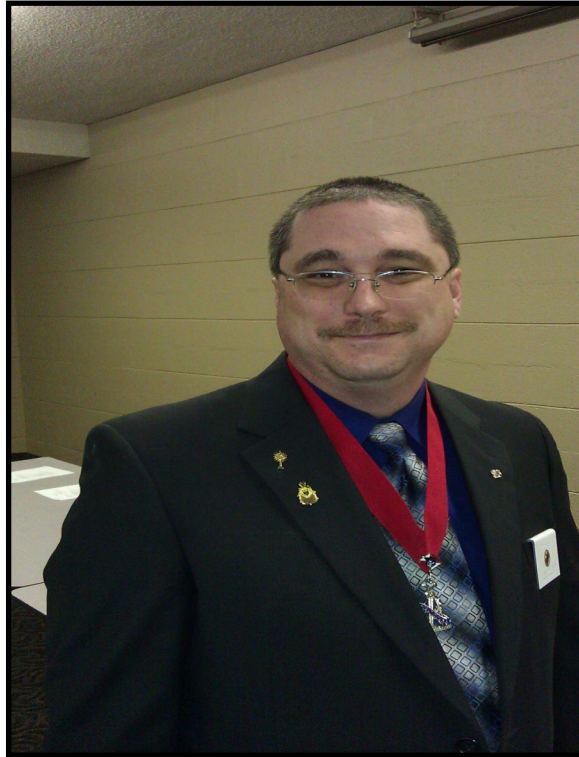
FAITHFUL NAVIGATOR OF THE 4TH DEGREE